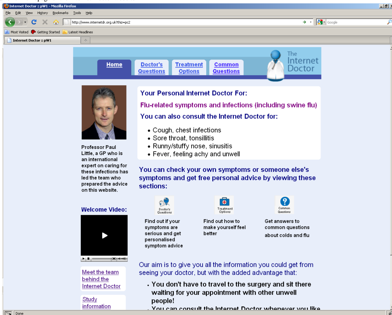
Figure 1. Homepage of the Internet Doctor website

The Diagnostic pages first asked a series of questions about the participant's symptoms; participants completed these pages for one symptom at a time, and could choose from cough, sore throat, fever, and runny/stuffy nose. Then a complex algorithm provided appropriate tailored advice on whether they needed to contact health services for that symptom (see Table 1). There were options to click on the answers to further questions about