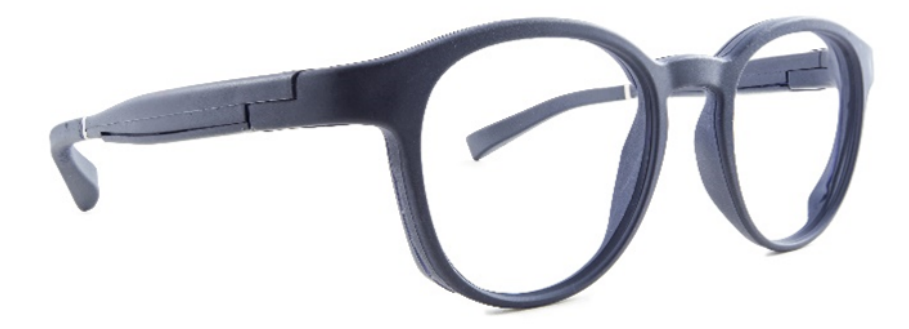
Figure 1. Smart eyeglasses (Ellcie Healthy) for fall detection and prevention in older adults.

The single assessment consisted of a 1-hour session with several tests. First, the clinician collected the demographic information. Second, the smart eyeglasses were described orally in French to the participants. The following standardized information was delivered: