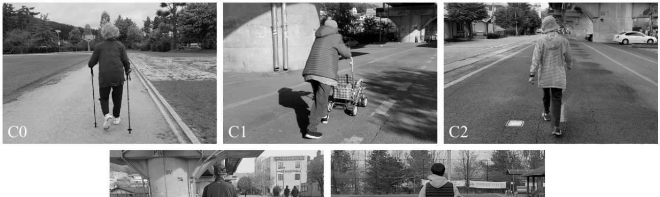
Figure 1. Five different gait styles: cane-assisted gait (C0), walker-assisted gait (C1), gait with disturbances (C2), gait without disturbances (C3), and gait without disturbances in young controls (C4).