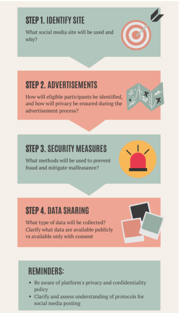
Figure 2. Steps in the institutional review board (IRB) process pertaining to social media-based recruitment methods.

Researchers should acknowledge and disclose terms of sites or apps before advertising recruitment on them to avoid third-party data sharing. For example, research participants who engage with study advertisements could—depending on the type of advertisement and social media site—allow third-party sites to collect information about their interests or affiliations unknowingly [25]. Participants are often unaware of the terms