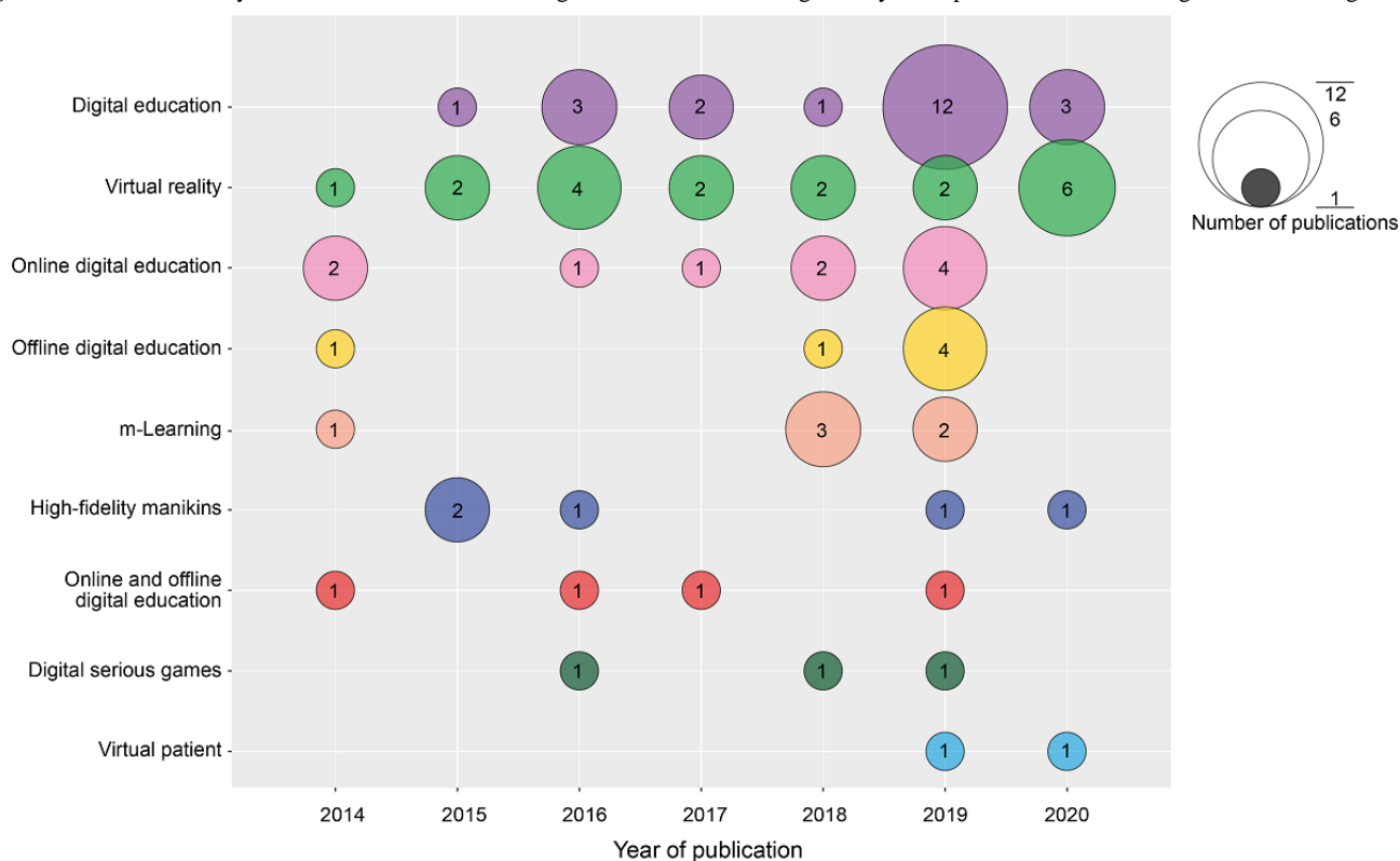
Figure 2. The number of systematic reviews on different digital modalities according to the year of publication. m-Learning: mobile learning.

e Includes study designs not described above or a combination of different study designs.