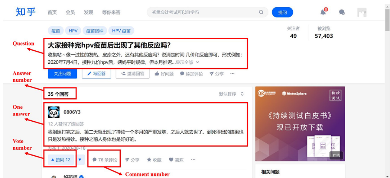
Figure 1. Screenshot of the main interface of Zhihu.

can find relevant questions and answers. A screenshot of the Zhihu interface is shown in Figure 1, which shows one question related to the HPV vaccine and the answers contributed by the community members. Under this particular topic, users could raise HPV vaccine–related questions while other community members with relevant knowledge (ie, contributors) answer the questions. We extracted all the questions with respective answers relating to the HPV vaccine available on Zhihu using the Python Web Crawler (Python Software Foundation) in March 2019. A total of 2953 answers with 270 corresponding questions were collected for the study. In addition, profile information of contributors (eg, gender and education) was also collected for data analysis.