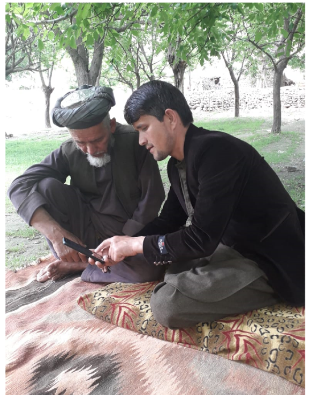
Figure 3. Awareness content being shown to the community.