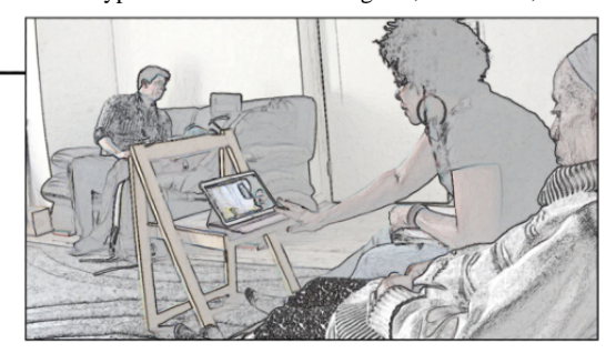
Figure 1. Example of a clinician and patient establishing a connection at the start of a Skype consultation. Da: daughter; Dr: doctor; Ns: nurse.

In this example, the patient and clinician have already done the work of preopening, the patient has been invited to a video consultation, with Skype addresses and video appointment times confirmed to enable that to happen, and phone numbers confirmed ensuring an alternative means of communicating. Once a connection is established, the patient and clinician do not greet each other but instead query the connection and confirm at the patient's end that they can see the doctor. Then, 2 periods of silence follow (3.0 and 3.9 seconds, respectively). During this time, the doctor is unsure what is happening: by not greeting, the patient and her daughter do not provide the doctor with evidence that they have a working video connection meaning that, for the doctor and nurse at the other end, it is not clear if there is a problem with the connection or video. The doctor's hello with its strong rising pitch (line 8) is not a