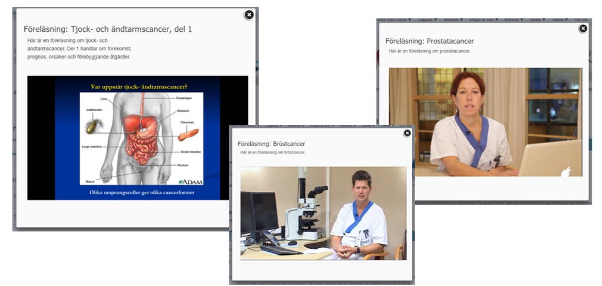
Figure 2. Diagnoses, with information on pathophysiology, prevalence, incidence, and prognosis (in Swedish).