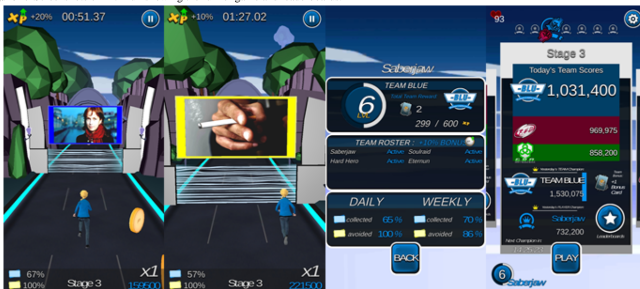
Figure 1. Screenshots of HitnRun showing the runner game and leaderboards.

RCTs to test the efficacy of this new approach and whether the specific design elements mediate efficacy are underway. We do not have these data yet. However, our main aim of elaborating this example was to provide concrete instantiations of design decisions that would not have otherwise emerged without an empathy-based DT approach.