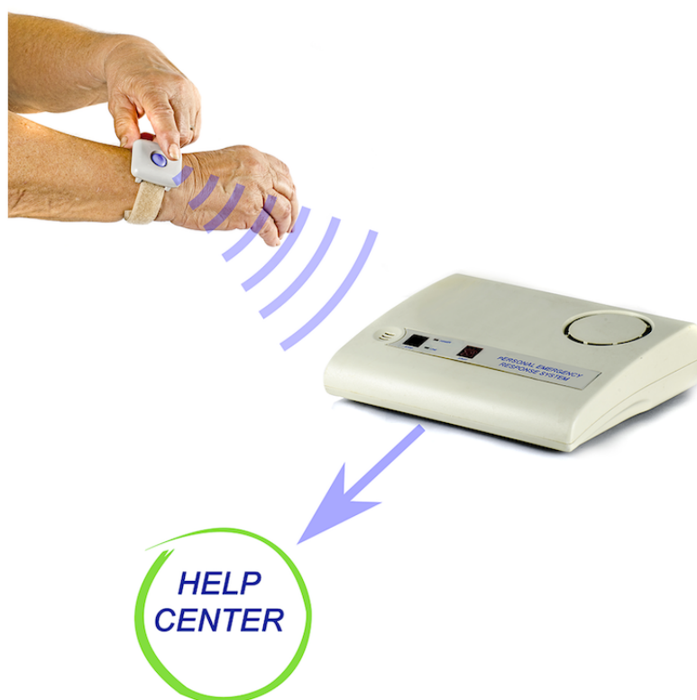
Figure 1. Illustration of the social alarm.

The daily care practice is hard to plan, as care is unpredictable and emergent activities within a network of actors forming complex interactions. This demands flexibility and the ability to adjust plans, prioritizing some work and deprioritizing other work [17].