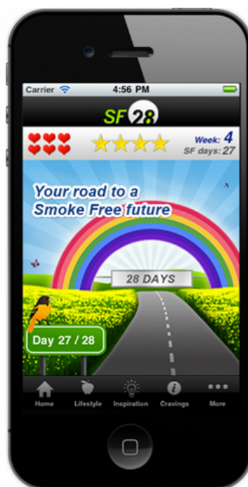
Figure 1. SF28 homescreen.