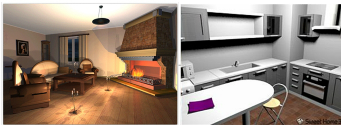
Figure 1. Examples of virtual home environments, lounge (left), kitchen (right), produced using Virtual Reality Interior Design Applications (VRIDA).

between clinician and patient and assist them in making shared decisions about how this sensitive and personalized space may be best adapted specifically to the patient’s individual needs. It would also provide an interactive simulation of the home, enabling the patient to “walk” through the home, via a personal computer or laptop, which could help therapists to better consider barriers to everyday performance and enhance the patient’s insight and motivation to participate in tailored interventions. VRIDA would provide the patient with the valuable opportunity to consult as an expert on their own needs, and participate as an equal partner in decision making, without feeling as if their mobility is being assessed, as is often the case when visiting the home in person with the practitioner. To date, however, the gains that VRIDA could bring to occupational therapy practice are yet to be capitalized upon, as little research has been carried out within this particular health care context.