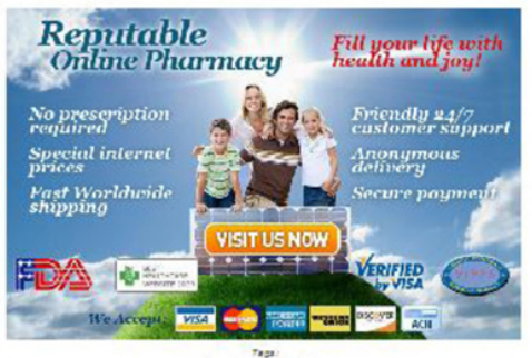
Figure 1. Unauthorized uses of Verified Internet Pharmacy Practice Sites (VIPPS) seal.

<sup>d</sup> Claims NABP VIPPS accreditation but not on NABP VIPPS accreditation list.