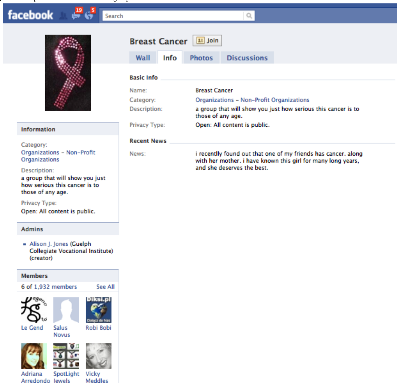
Figure 4. Sample breast cancer awareness group on Facebook in 2010