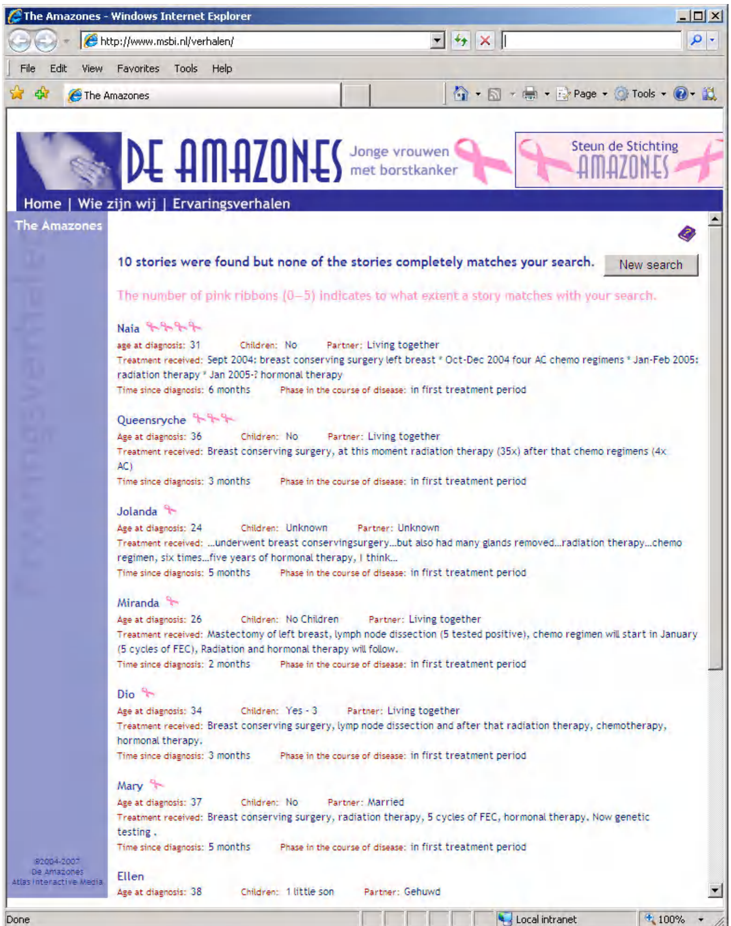
Screenshot 3b: A list of stories retrieved in the author profile group.