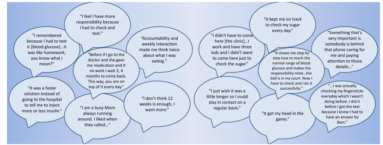
Figure 3. Patient feedback on the intervention.

A total of 27 patients in the MITI arm offered qualitative feedback on the intervention. Figure 3 shows selected quotes (from 11 patients) transcribed from the interview. The 14 quotes included in the figure are among the most specific comments made by patients about their experiences in the intervention.