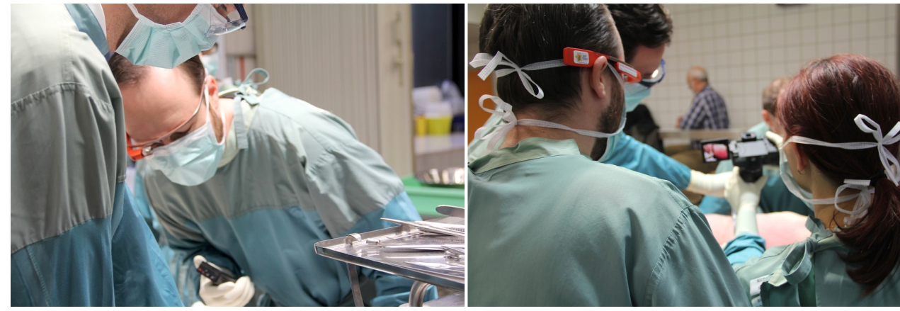
Figure 1. A typical crowded autopsy situation. On the left, the forensic pathologist is wearing Google Glass, allowing him to take pictures in a hands-free manner. On the right, the procedure is interrupted by an assistant taking a picture with a camera, which narrows the already limited space around the body.