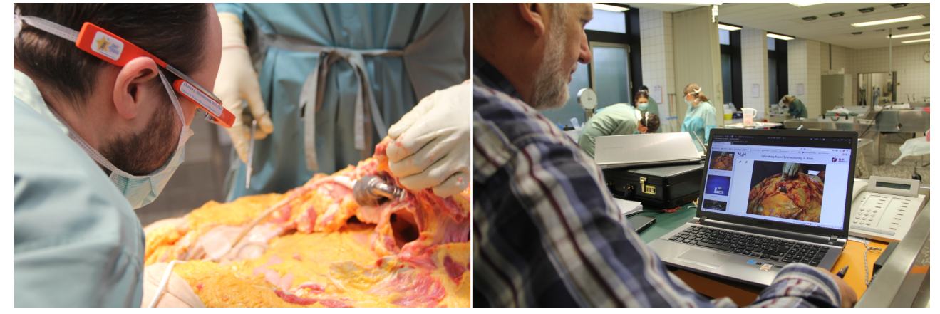
Figure 2. A forensic pathologist taking a picture of the situs using Google Glass during an autopsy (left). The Blink-app app transmits the image to the laptop where it is immediately presented to the attending detective and the public prosecutor (right).