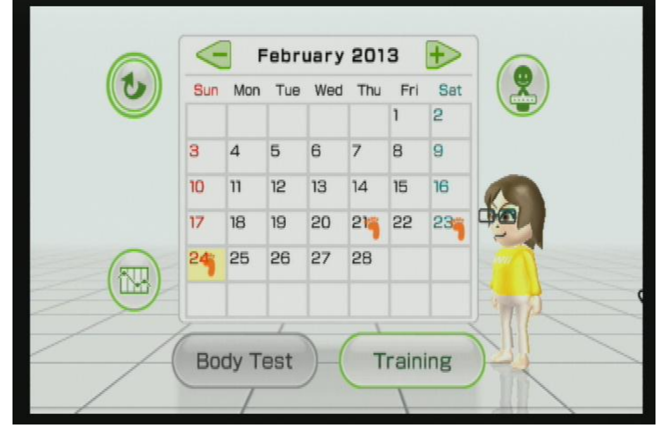
Figure 2. An example of a workout calendar from Wii Fit Plus.