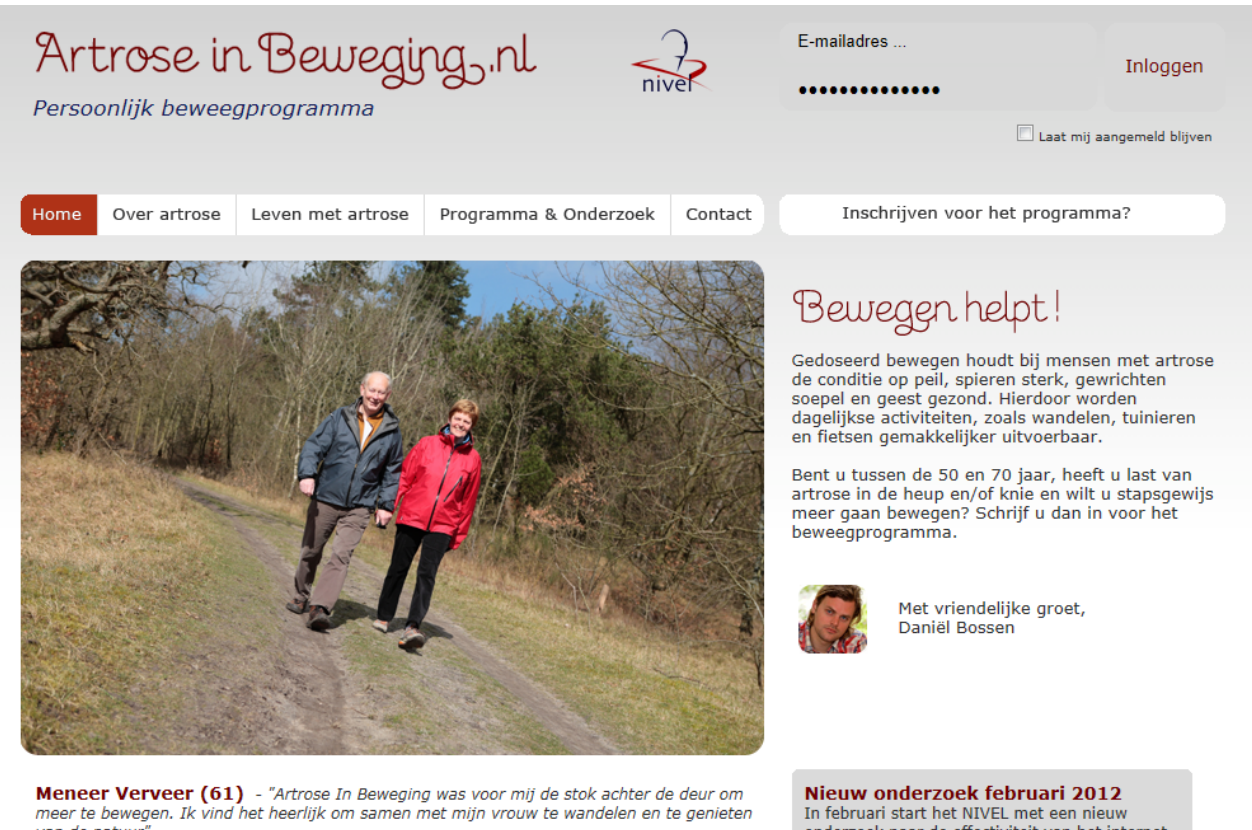
Figure 1. Homepage Join2move.

Numerical Rating Scale (0 is no pain, 10 is worst possible pain). Performance is measured by three items: (1) "I completed the module as instructed", (2) "I did more than the instructed module", and (3) "I did less than the instructed module" (due to time constraints, weather conditions, pain in my knee and/or hip, or other physical complaints). Subsequently, tailored to the answers from the evaluation form, automated text-based messages are generated. If users indicated that a module was missed due to time constraints or weather conditions, they had the option to repeat the current module or to continue with the next module. When users indicated that a module was missed due to pain in knee and hip or other physical complaints, they had the option to repeat the module (a maximum of three times), adapt the intensity of the module, or proceed to the next module. Since personal messages are updated on a weekly basis, users are encouraged to log in once a week. Automated emails are generated if participants do not log on the website for 2 weeks. At the end of the program, the website presents a motivational message to perform regular PA in the future. In total, the program lasted 9 weeks.