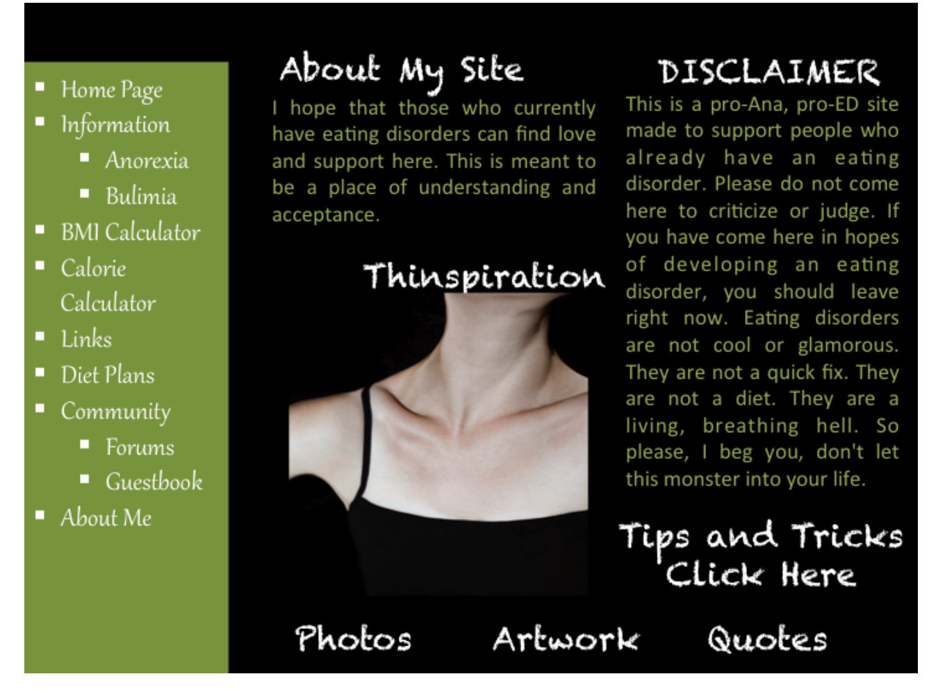
Figure 1. Mock pro-eating disorder website with typical content.

Great concern has been raised over pro-ED websites; however, relatively little is known about their users. No study has examined a large group of pro-ED website users from a clinical perspective, nor have associations between disordered eating patterns and escalating levels of site visitation been described. The purpose of this study was to examine the demographics, media use patterns, and eating behaviors of pro-ED website visitors, and the degree to which website usage correlates with disease severity and quality of life.