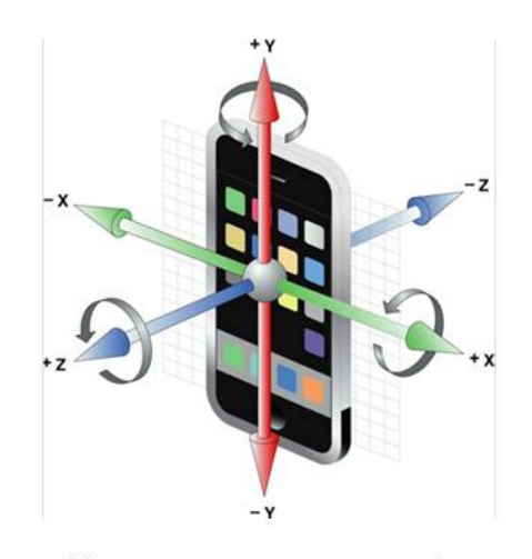
(b) Gyroscope measures rotation