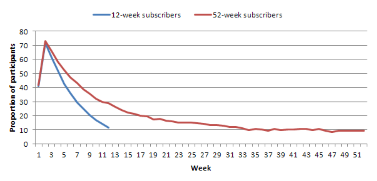
Figure 2. Percent of participants who weighed in per week for 12- and 52-week subscribers.

(ie, 89% of participants' weight data was missing). For 52-week subscribers, the decline in the number of participants self-reporting their weight was continuous from week 2 (73%) to week 32 (12%). However, after week 32, the percentage of participants self-reporting a weight reached a plateau but remained steady at 9% to 11% until 52 weeks. Therefore, 91% (2412 /2656) of participants' weight data was missing at week 52