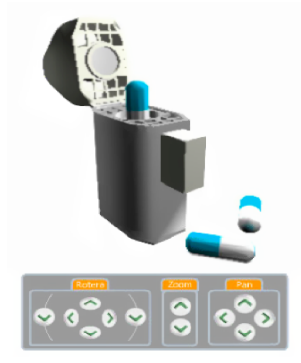
Figure 2. The Ingelheim asthma inhaler displayed using the first version of the 3-dimensional player

A semistructured interview was administered on a separate occasion. The interview covered the following areas: general impressions; specific impressions concerning audio and video features, co-browsing features, and 3D; locus of control (self/advisor); level of activeness (self/advisor); usefulness of service; and target audience.