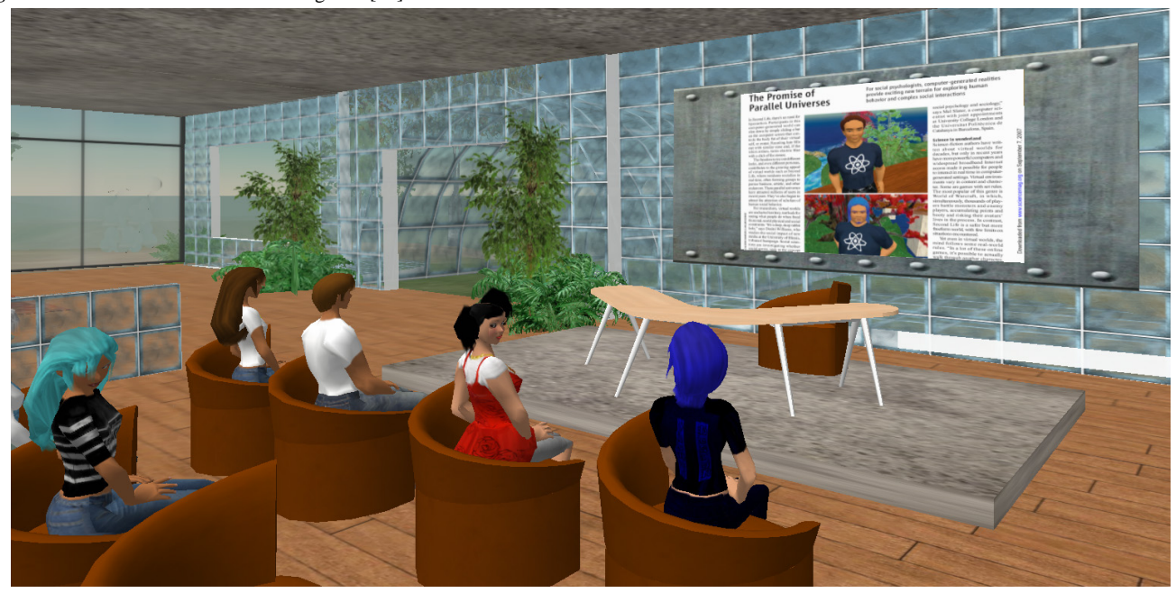
Figure 1. A screenshot from the Learning area [56]

The goal of the Community area is to use the strength of virtual communities to provide real-life insights aimed at improving living habits. The Community area is organized around different