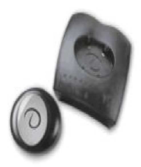
Figure 2. The SportBrain First Step enhanced pedometer and Sportport interface